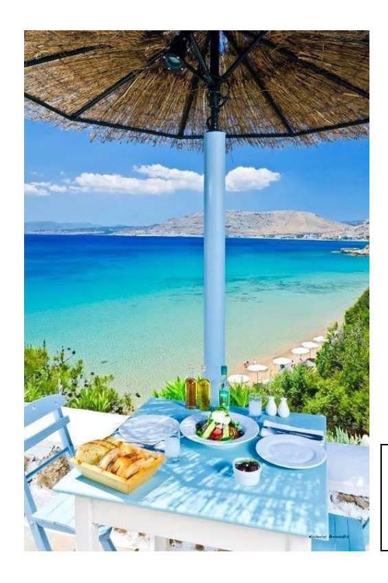
Fantastic spot for lunch, sundowners or your evening meal.

Pefkos comes from the word Pefki meaning 'pine tree' and this popular resort and beaches are backed by hundreds of fragrant trees. Pefkos has a beautiful long main beach with several great tavernas dotted along and this is a perfect place for a sundowner. There are several other smaller beaches in Pefkos which are also worth visiting, including Aghios Thomas which is at the southern end of the resort and then further along and just outside of Pefkos is Plakia Beach.